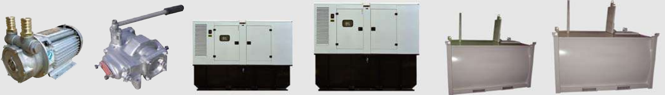
Auto filling fuel pump